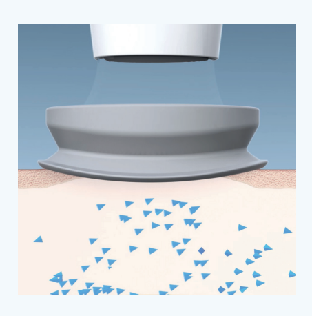
Negative pressure creates a lift in the tissue, which can be challenging to achieve with conventional methods.